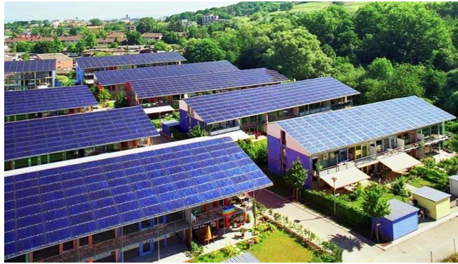
Fig. 3.1: German solar city produces four times more energy than it uses. German architect Rolf Disch one-upped them all by creating an entire solar city. SonnenSchiff in Freiburg is a small community that is entirely powered by the Sun, with rooftop solar panels everywhere you turn. Combined with Passivehaus principles that utilize energy efficiently, the city can generate up to four times as much electricity as it needs.

building is meant to take whatever orientation the architect deems fit. However, in areas where there is a cluster of buildings probably shielding some other buildings from direct sunlight making it almost impossible for building orientation to be exploited to the fullest, other means of solar energy could be harnessed.