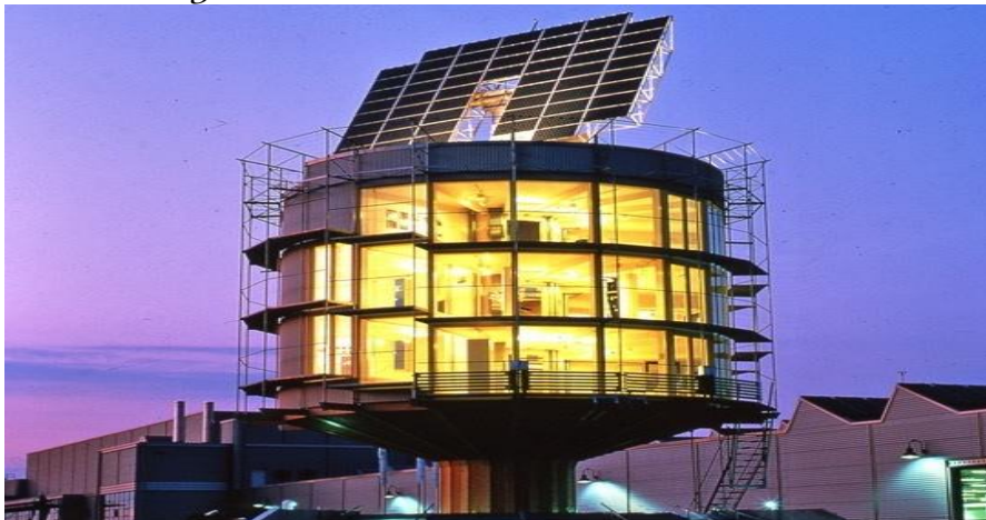
fig 5.1.1: The spinning, sun-chasing Heliotrope designed by Rolf Disch.

It can generate up to five times as much power as it needs to operate. The home sports a giant angled solar array on the roof and the entire structure is mounted on a pole timed to rotate 180 degrees each day as it follows the sun.